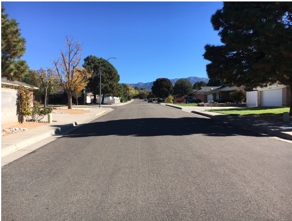
Figure 3: Trail Ridge Road looking east