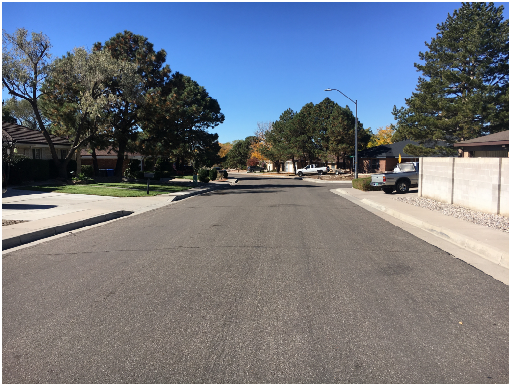
Figure 4: Trail Ridge Road looking west