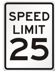
Figure 2: Trail Ridge Road Speed Limit

Trail Ridge Road is a 28-ft wide roadway with curb and gutter and 3.5-ft wide sidewalks. See Figure 3 and Figure 4 for photos of the existing roadway, and Figure 5 for the existing Trail Ridge Road typical section.