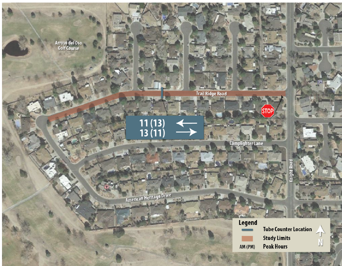
Figure 1: Project Area and Existing Traffic Volumes

The Trail Ridge Road project is located in Albuquerque, New Mexico and is approximately 0.29 miles (1,506 feet) in length. Trail Ridge Road is a two-lane, undivided local street that runs east-west, from American Heritage Drive to Knight Road. American Heritage Drive is also a two-lane, undivided local street that runs north-south and intersects Trail Ridge Road from the south by means of a free-flowing curve at the west end of Trail Ridge Road. Knight Road is a two-lane, undivided local street that runs north-south and intersects the east end of Trail Ridge Road at a T-intersection. See Figure 1 for a map of the project area.